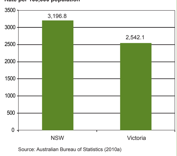
Figure 2. Rate of court appearance per 100,000 population by state, 2008/09

Table 3 shows the differences in rates of appearance by principal offence type, ranked in terms of the NSW/Victorian rate ratio. The data were obtained by dividing the number of